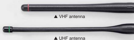
▲ VHF antenna